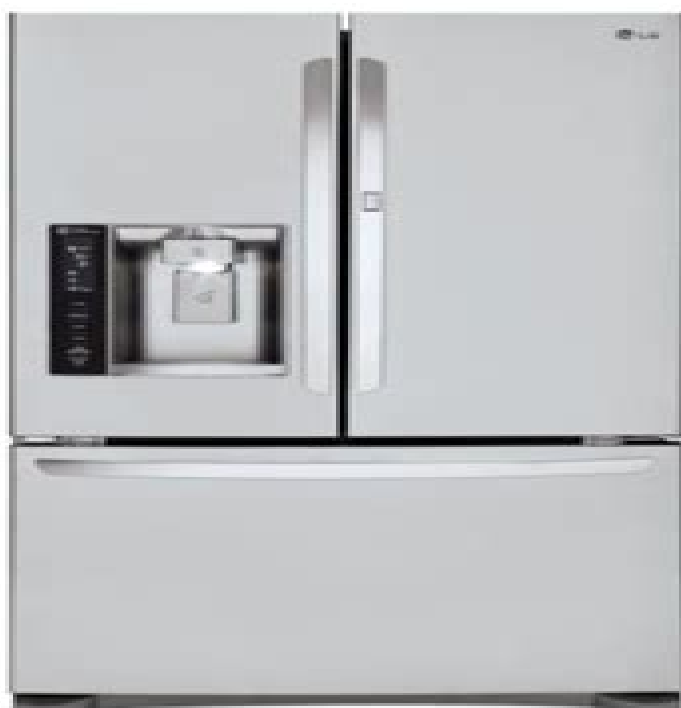
MODEL : LFXS24566S