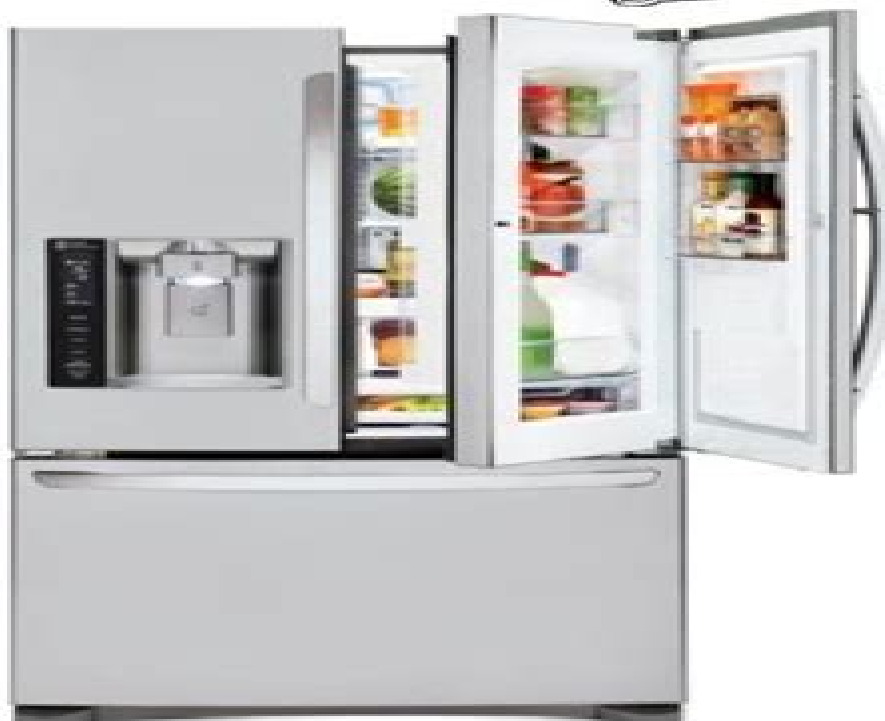
COLOR : STAINLESS(ST)