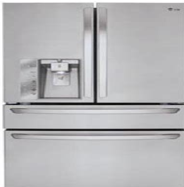
COLOR : STAINLESS(ST)