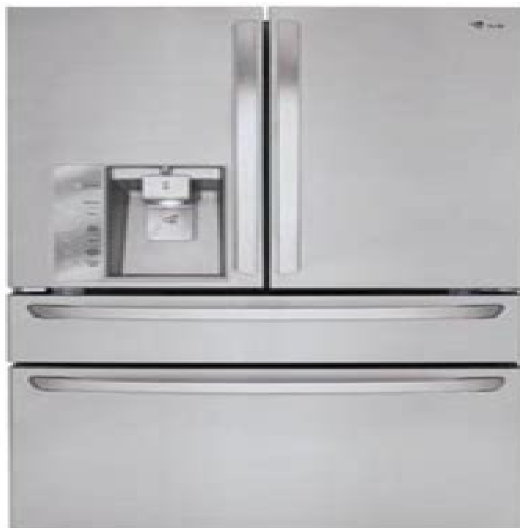
MODEL : LMXS30756S