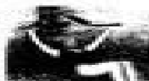
Lat pull down