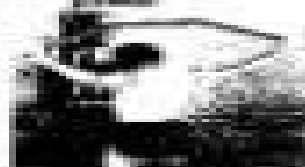
Seated neck pull down