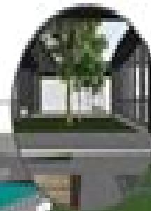
Adaptive Comfort & Natural Ventilation