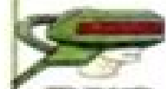
1859 Thomas Edison's light bulb