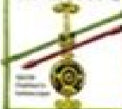
1769 James Watt's steam engine