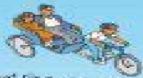
Spot the cycle rickshaws.