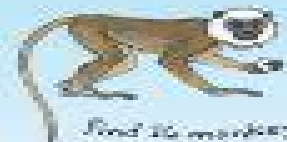
Find 16 monkeys.