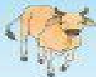
Find seven cows.