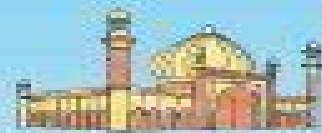
Spot a mosque.