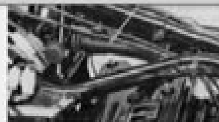
A, Radiator Hose