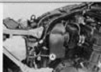
A, Reverse Tank Hose