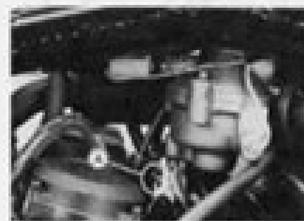
A, Choke Cable Lower End