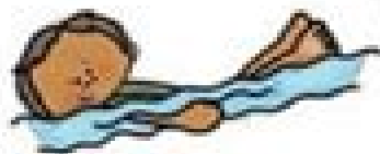
Swimming on your back

Cut out the items and place them on the correct sheet to show if they are safe or not safe.