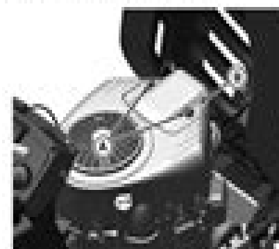
Air intake screen is shown.

IMPORTANT: Avoid damage! To prevent engine damage, do not allow any foreign objects to fall into the carburetor air intake.