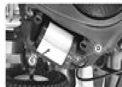
Air intake screen is shown.