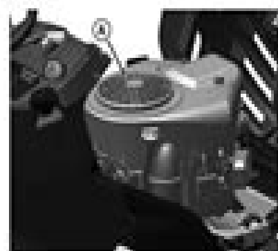
Air intake screen is shown.