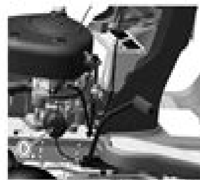
Oil filter is shown.