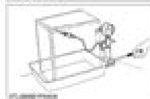
(2) Fuel Injection Pressure