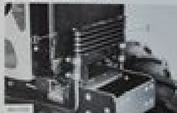
(1) Heat sink (2) Oil Cooler