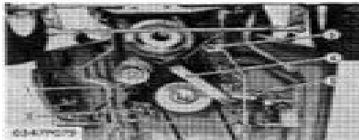
63477002 (1) Spring (4) Tension Pulley (2) Speed Change Rod (5) Clutch Rod (3) Tension Spring