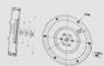
FIGURE 10, FIGURE 11, FIGURE 12