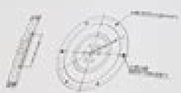
FIGURE 10, FIGURE 11, FIGURE 12