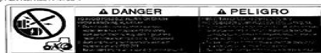
(5) Part No. K3611-4765-1