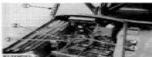
11460-11469 (1) Grip (2) ATA PTO Cable (3) PTO-Clutch Lever (4) PTO-Clutch Wire