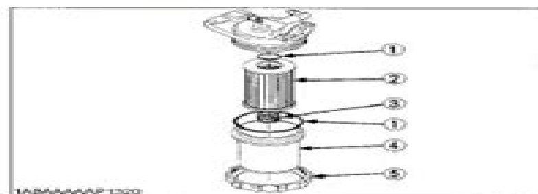
TABAAAAAP1320 (1) O ring (2) Filter element (3) Spring (4) Filter bowl (5) Screw ring