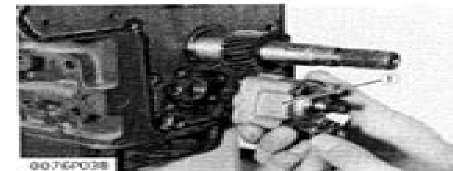
(1) Oil Pump Assembly