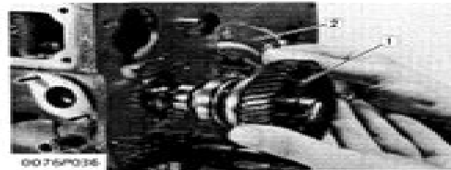
(1) Fuel Camshaft Assembly