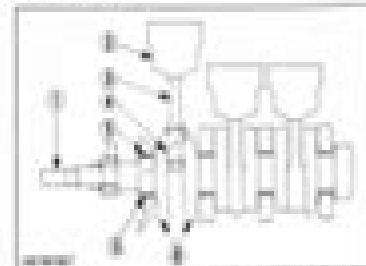
(1) Crankshaft (2) Main bearing (3) Crankshaft bearing (4) Piston rod (5) Crankshaft bearing (6) Piston rod

The crankshaft (1) is driven by the piston (2) and connecting rods (3) and carries reciprocating motion into rotary motion. It also drives the oil pump, camshaft and fuel camshaft. The counterweights (4) are integrated into the unit to minimize bearing wear and lubricating oil temperature rise.