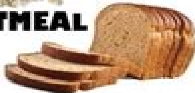
WHOLE WHEAT BREAD