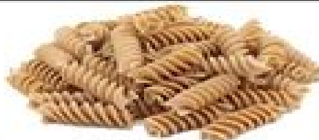
WHOLE WHEAT PASTA