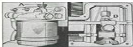
Fig. L1—On HR3 and HRW3 models, bleed screws are located at "A" on fuel filter body and "B" on fuel pump. Refer to text.

If operating temperatures fall below 10°F., an SAE 10W weight oil is recommended. In temperatures between 10° to 85°F. use SAE 20-20W and above 85°F. use SAE 30 or 10W-40.