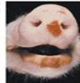
2.69 Growing pig. Lesions in the snout area following the formation of vesicles. Another example of fever vesicular disease (FVD).