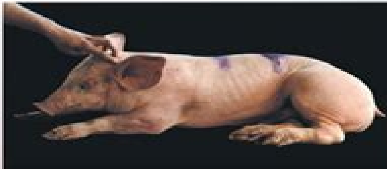
2.66 Growing pig showing emaciation, lethargy and fever. May be caused by classical swine fever (CSF, African). Similar clinical signs can be observed in hog cholera's disease and in leptospirosis.

This necropsy protocol respects the different traditional incision and observation planes, as well as the sampling methods for further studies.