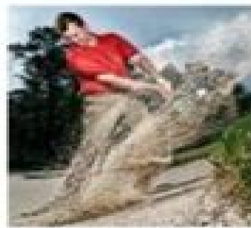
QUICK-AND-EASY BUNKER ESCAPES