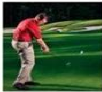
KNOCK IT STIFF WITH YOUR WEDGES

The Ultimate Guide to Saving Strokes and Getting Up and Down