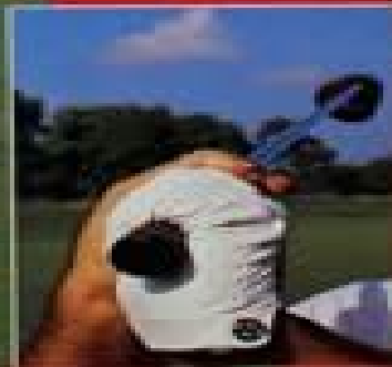
Club face open at the top of the swing