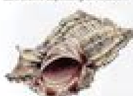
Apple Murex (CB)

Chamaelea alveolata To 2 in. (5.1 cm) Elaborate pinkish-white to brownish shell with long flaps.