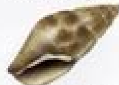
Carinate Downsail (W)

Chamaelea pumila To 4.5 in. (11.4 cm) Yellow-white to brownish shell has raised ribs but lacks long spines. Note brown spots on outer lip of shell.