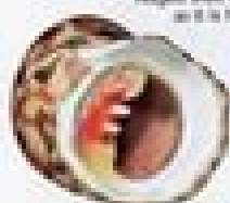
Bleeding Tooth (CB)

Hydrobia ulitiformis To 1 in. (2.5 cm) Brown to white shell has body seal frills and spines. Species found in aquatic waters have smoother shells. Found in intertidal waters.