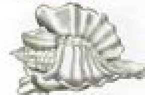
Foliate Thornmouth (W)

Cerithium foliatum To 1.5 in. (3.8 cm) high Shell has three large, leaf-like flanges. Color varies from white to dark brown depending on location.