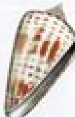
Alphabet Cone (CB)

Cerithium californicum To 1.8 in. (4.5 cm) Spiral high-spired shell is common on intertidal flats in estuaries and bays. Can climb trees and be out of water for extended periods.