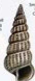
California Horn Snail (CAS)

Conus californicus To 1.5 in. (3.8 cm) high Smooth brownish shell has a low spine. A carnivorous species that preys on prey with a harpoon-like tooth that injects poison. Do not handle live specimens.