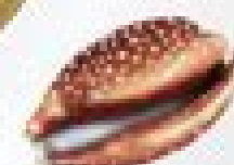
Atlantic Deer Cowrie (CB,CB)

Olivella septentrionalis To 2.5 in. (6.3 cm) Glossy, yellow to grayish cylindrical shell has markings that resemble lettering. South Carolina's state shell.