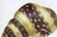
Checkered Periwinkle (W)

Littorina maritima To 1 in. (2.5 cm) high Grayish-white, sculpted shell has low spiral ridges. Common in marshes and estuaries.