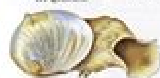
Solitary Glassy Bubble (V)

Conus septentrionalis To 3 in. (7.6 cm) Creamy shell has bands of red-brown splashes. Mouth is a long dagger out of the narrow end of the shell.