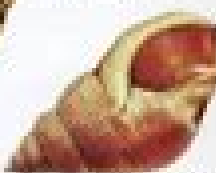
Channeled Nassa (CA)

Scaphella junonia johnstonensis To 3 in. (7.6 cm) Deep water Gulf Coast shell only reaches up on shore after storm storms. Alabama's state shell.