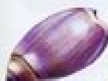
Purple Dwarf Olive (W)

Littorina littorea To 1 in. (2.5 cm) Gray to brown rounded shell has a low spine and low spiral ridges. More tip is white. Found in estuarine waters.