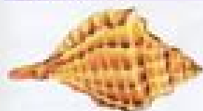
Thick-shelled Oyster Drill (E)

Euryspira caudata To 1.5 in. (3.8 cm) high Small shell has a pointed apex and spiral ridges. Feeds primarily on oysters.