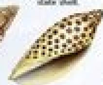
Johnstone's Junonia (CB, CB)

Nassarius trilineatus To 1 in. (2.5 cm) high Whitish shell has 4-6 beaded spiral ridges. Southern specimens often have 3 spiraling red brown lines.