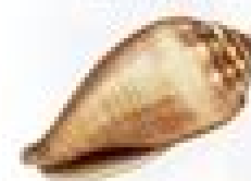
California Cone (CAS)

Alia carinata To 3 in. (7.6 cm) high Small shell has a pointed apex. Inside is pinkish white. Common in shallow water.