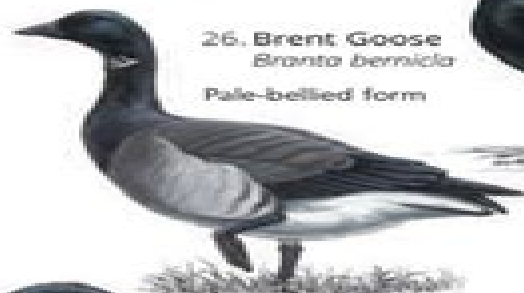
26. Brent Goose Branta bernicla Pale-bellied form