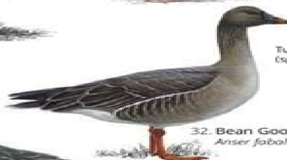
Tundra form (spp. rossicus)