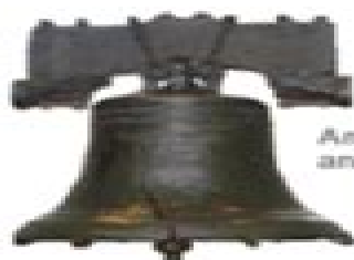
American History and Geography