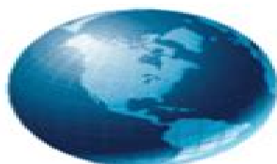
World History and Geography

Content and Skill Guidelines for Grades K-8