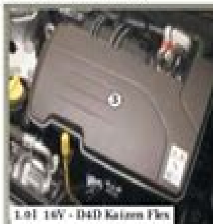
1.0 I 16V - D4D Kaizen Flex

Libere a lingüeta 2 e, em seguida, gire ligeiramente a tampa 1 no sentido anti-horário para extraí-la. Substitua o elemento filtrante e reponha a tampa.