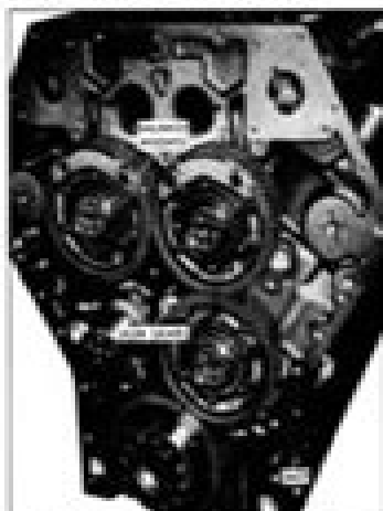
Fig. 2. Typical Balance Weights on Rear Side Gears