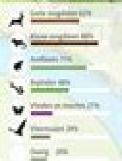
Percentage MjPO-voorzieningen geschikt voor diersoorten