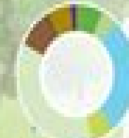
Aantal verschillende typen faunavoorzieningen aangelegd binnen het MjPO

Door de aanleg van overbruggen, spoorwegen en kanalen in het verleden zijn Nederlandse natuurgebieden van versnipperd gemaakt en zijn de leefgebieden van veel diersoorten verkleind. Met het realiseren van verschillende faunavoorzieningen worden deze natuurgebieden weer met elkaar verbonden.