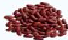
Kidney Beans (Canned)