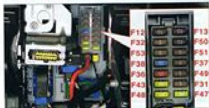
CONEXIÓN Y ESTADO DE MONTAJE DEL CALCULADOR DE MONTAJE