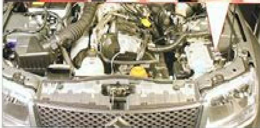
SITUACIÓN Y CONEXIÓN DEL CALCULADOR DE MONTAJE MOTOR