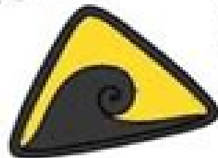
High surf wave