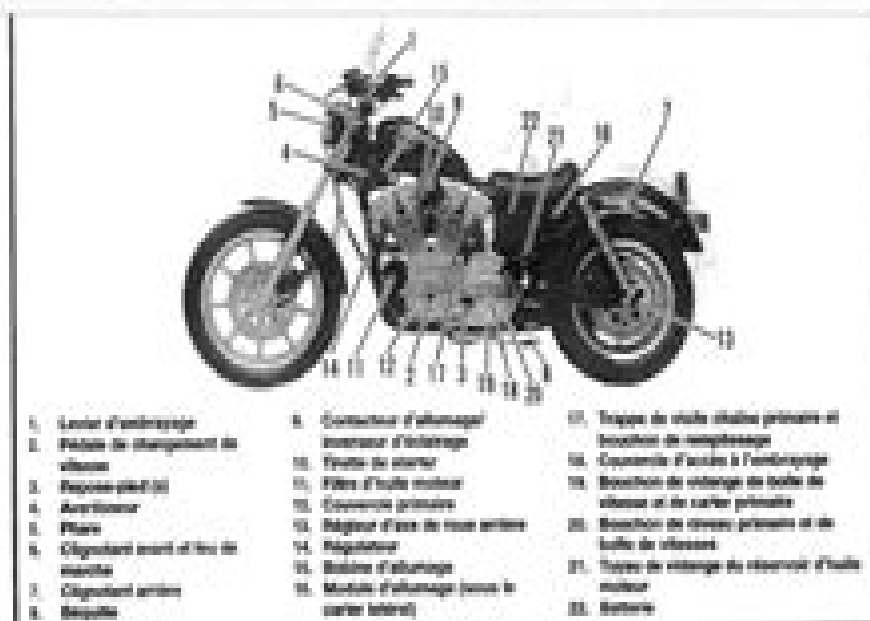
Fig. 883 - Vue côté gauche