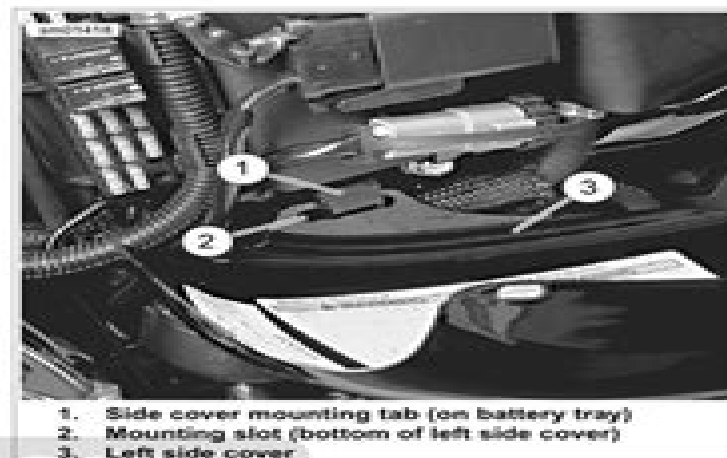
Figure 2-162. Left Side Cover in Open Position: All Models (XL Model Shown)

Leaning or placing tools on side cover could cause damage to cover and/or mounting tab on battery tray. (00523b)