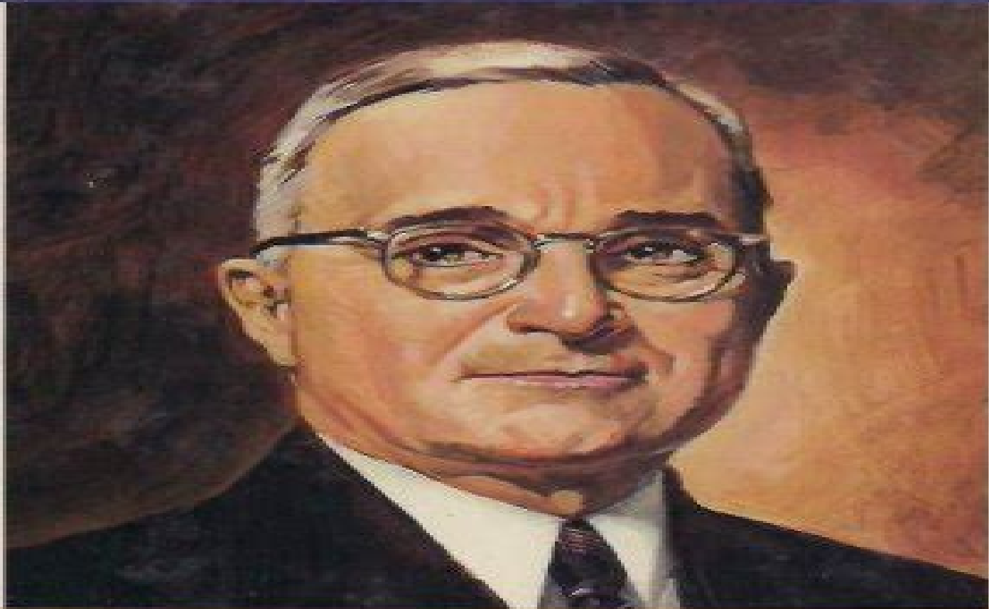
Harry S. Truman