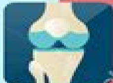
Joint Pain and Stiffness