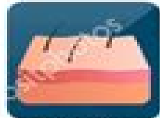
Pale, Dry Skin