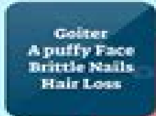
Goiter A puffy Face Brittle Nails Hair Loss