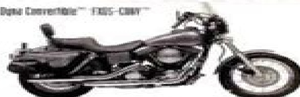
Dyna Convertible™ - FXDS-COM™