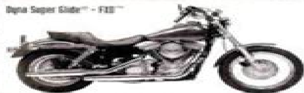
Dyna Super Glide™ - FXD™