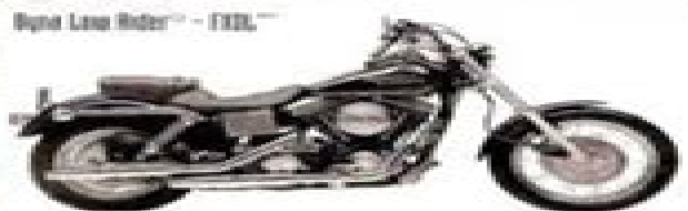
Dyna Low Rider™ - FXDL™