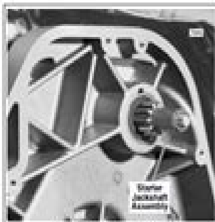
Figure 5-21. Primary Chaincase

If only the jackshaft bolt, thrust washer, lockplate, pinion gear and/or spring require servicing, then the primary chain and clutch assembly may be left in place.