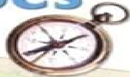
Directions Students in Room 9 Travel to Get Home From School