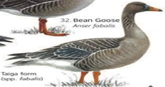
32. Bean Goose Anser fabalis