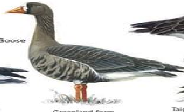
Greenland form (spp. flavirostris)