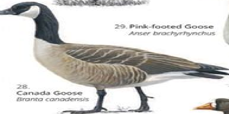
28. Canada Goose Branta canadensis