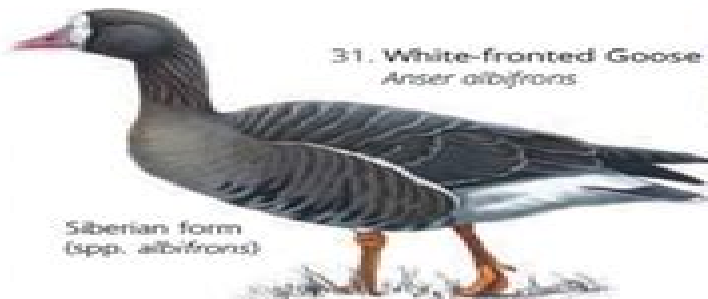
Siberian form (spp. albifrons)