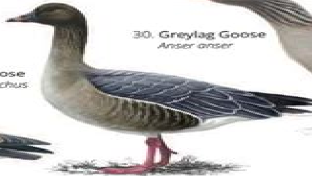
30. Greylag Goose Anser anser