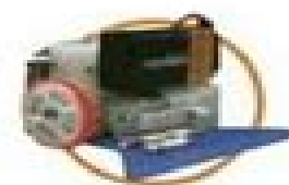
9v alkaline battery