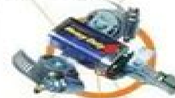
salvaged tin sheet