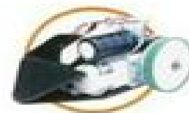
cassette deck motor