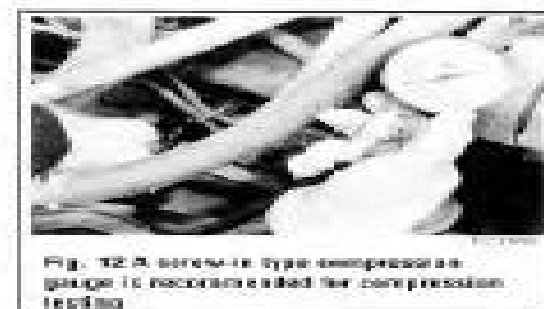
Fig. 12 A screw-in type compression gauge is recommended for compression testing.