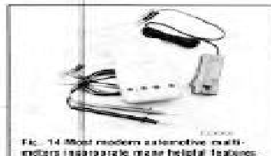
Fig. 14 Most modern automotive multi-meters incorporate many helpful features.