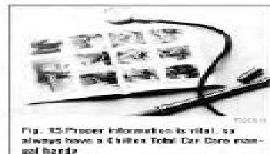
Fig. 15 Proper information is vital, so always have a Chilton Total Car Care manual handy.

The choice of a timing light should be made carefully. A light which works on the DC current supplied by the vehicle's battery is the best choice. It should have a sensor tube for brightness. On any vehicle with an electronic ignition system, a timing light with an inductive pickup that clamps around the No. 1 spark plug cable is preferred.