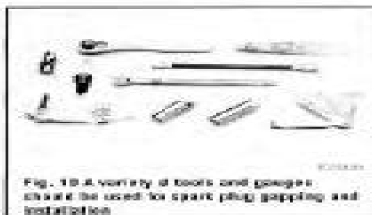
Fig. 10 A variety of tools and gauges should be used for spark plug gapping and installation.