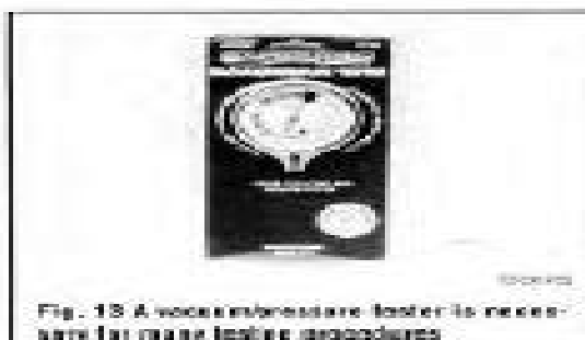
Fig. 13 A vacuum/pressure tester is necessary for many testing procedures.