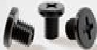
Loose components, screws or cables