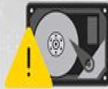
Failing hard drive