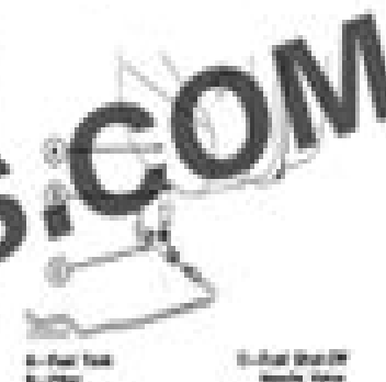
4-Fuel Tank 5-Filter