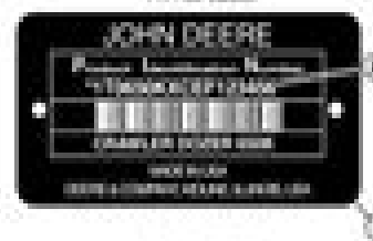
Example of PIN Plate