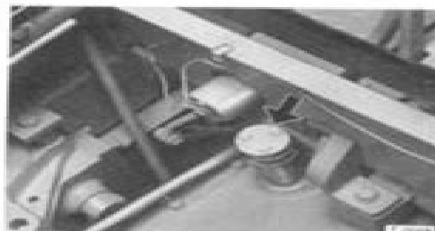
Fig. 10-Transmission Oil Dipstick

The transmission dipstick is located under the seat. The oil level should be between the marks on the dipstick with threads resting on filler tube and the engine off. Add sufficient John Deere Type 303 Special-Purpose Oil or an equivalent to bring oil to this level.