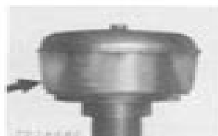
Fig. 9-Pre-Cleaner Attachment

Check the pre-cleaner and empty it if the accumulation of foreign material is up to the mark on the plastic bowl.