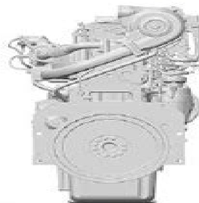
Single Turbocharger (Side Mounted) — Stage III 6000 Engine — Rear View