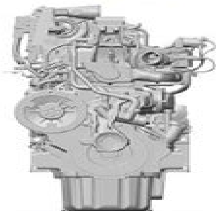
Single Turbocharger (Side Mounted) — Stage III 6000 Engine — Front View