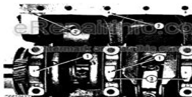
Fig. 8—Main Bearing Cap Positions