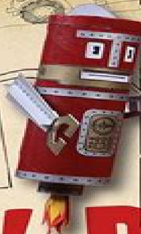
Table Robot Rocket, p. 97