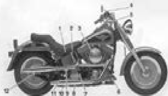
Fig. 100 (P.100) - Left Side View (Typical - 1997 Model Shows)